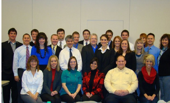
East Peoria Chamber of Commerce Community Leadership School :: 2010